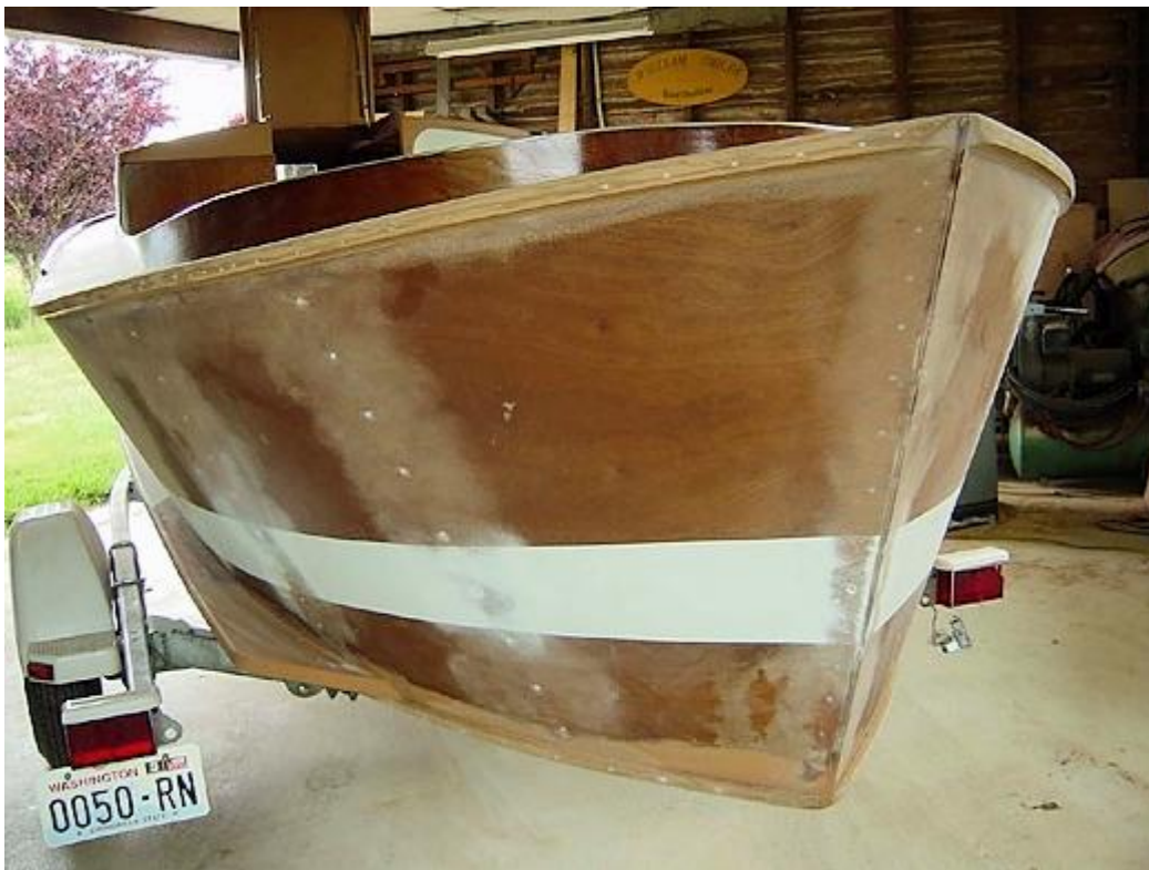
Stern view of the 19' Cabin Bartender. Note how the splash rail ends wide at the stern to assist the boat to a fast plane.