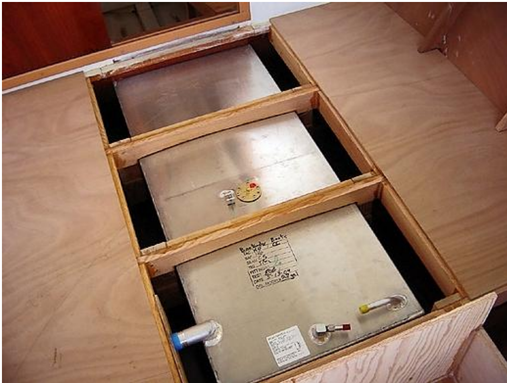
Above: The installed 27 gallon gas tank. Below: The sliding cabin door exposes a double 'V' berth with a small cooking shelf to port.